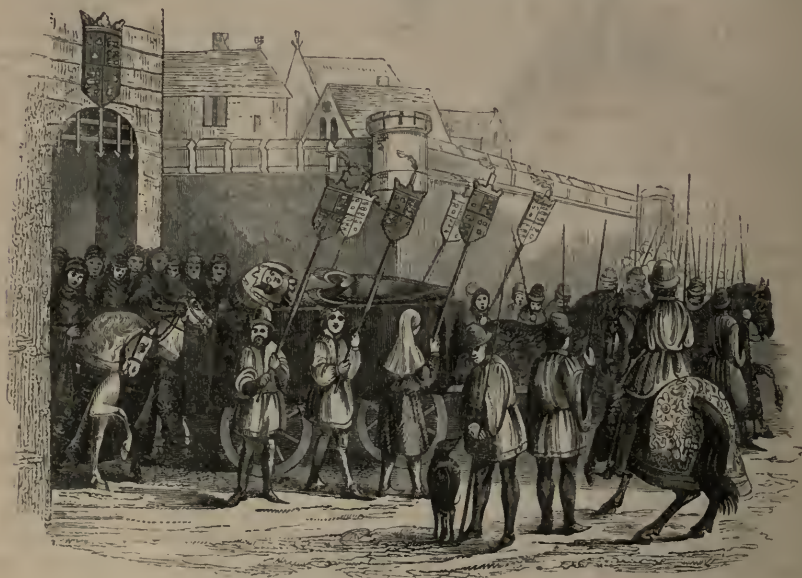
FUNERAL PROCESSION OF RICHARD II. FROM MSS. OF 15TH CENTURY

It was not long after this that a true report was current in London of the death of Richard of Bordeaux. I could not learn the particulars of it, nor how it happened, the day I wrote these chronicles*. Richard of Bordeaux, when dead, was placed on a litter covered with black, and a canopy of the same. Four black horses were harnessed to it, and two varlets in mourning conducted the litter, followed by four knights dressed also in mourning. Thus